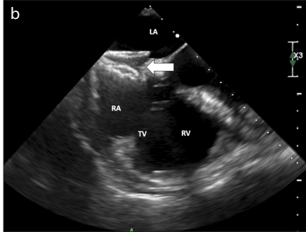
Figure 3. a, b. AngioVac canister (a) with evacuated thrombus. Midesophageal view at 0 degrees (b) transesophageal echocardiography shows the right atrium and ventricle post AngioVac thrombectomy demonstrating removal of most of the right atrial mass. The Amplatzer Cribriform Septal Occluder Device (arrow) remains in stable position across the interatrial septum. LA, left atrium; RA, right atrium; TV, tricuspid valve; RV, right ventricle.

ents a complex clinical challenge. Right atrial thrombus is associated with significant morbidity and mortality, including the risk of fatal pulmonary embolism. In the presence of an intracardiac right-to-left shunt, such as a PFO, the risks of a right atrial thrombus are greatly increased due to the potential for systemic embolization and resultant end-organ dysfunction (paradoxical embolic stoke, limb ischemia, and mesenteric ischemia).